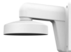
Indoor/Outdoor wall mount DS-1272ZJ-120