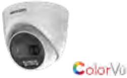
ColorVu PIR siren turret camera DS-2CE72DFT-PIRX0F