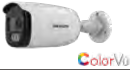
ColorVu PIR siren bullet camera DS-2CE12DFT-PIRX0F