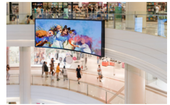
Indoor LED Screen