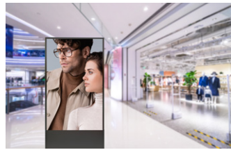
LED Poster Display