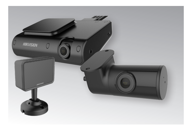
The G4 Dash cameras for commercial solutions, provide high-resolution footage of what happened on the road and around the vehicle.