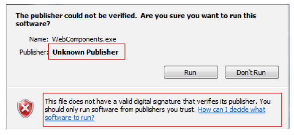
Figure 2, Windows 7 Warning