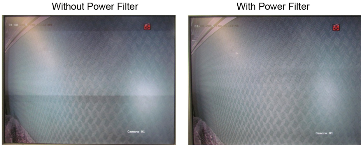
Figure 4, Comparison of Display without Power Filter (left) and with Power Filter (right)

Figure 4 shows an affected display with and without a power line filter.