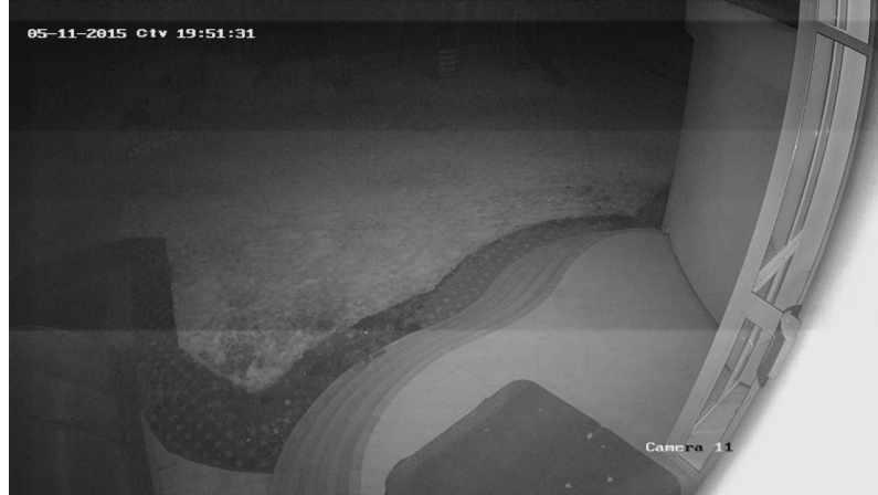
Figure 2, Black and White Display with Uneven Horizontal Banding