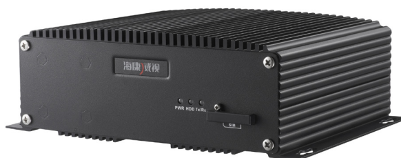
Hikvision's SSD (Solid State Drive) NVR can withstand vibration and temperature extremes.