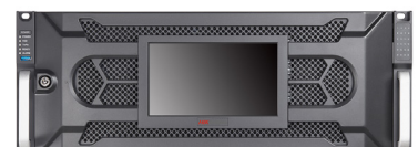
A rack-mount embedded NVR for the high-end market supports up to 256 channels.