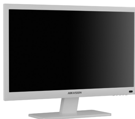
All-in-one NVR combines an embedded NVR with an LCD monitor.

For multi-site businesses, standardizing on embedded NVRs removes many of the variables and ensures system uniformity across a variety of sites.