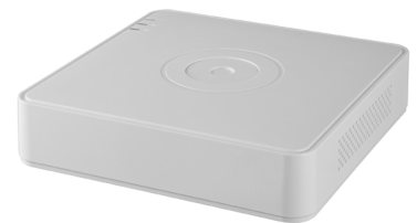
Hikvision entry-level NVR.