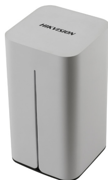
Hikvision's mini WiFi NVR for private residences or small businesses.

NVRs provide outputs and interfaces to facilitate integration with a variety of alarms and access control systems, not to mention point-of-sale (POS) systems and business intelligence systems.