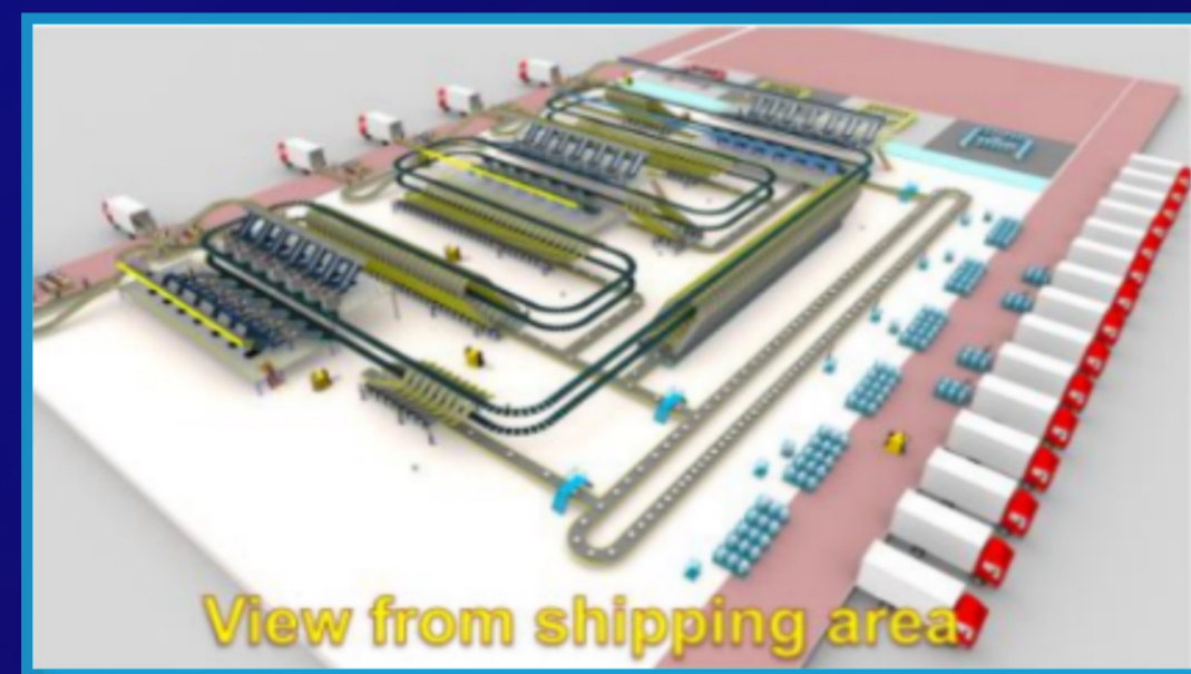
View from shipping area