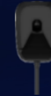
Advanced Driver Assistance System