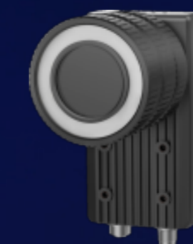
Smart Code Reader Parcel ID