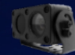
Blind Spot Detection Product