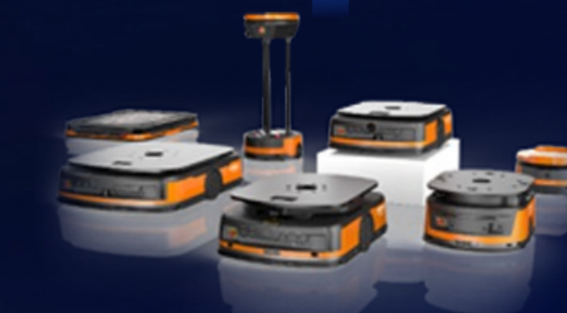
Autonomous Guided Vehicles (AGV) Autonomous Navigation

Create systems to streamline how workers pick products and pack orders