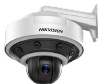
DS-2DP0818Z-D PanoVu series 16MP 360°Panoramic+PTZ Camera