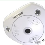
DS-2XM6362F-I (S) On-board Fisheye Network Camera