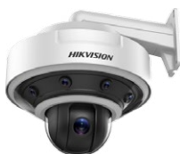
DS-2DP1636Z-D PanoVu series 16MP 360°Panoramic+PTZ Camera